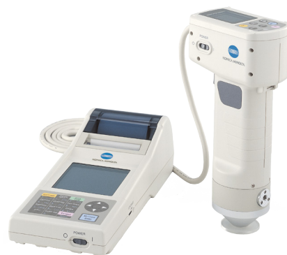
Chroma Meter CR-400

A colorimeter (such as Chroma Meter CR-400) consists of a light source, fixed-geometry viewing optics, three photocells matched to an internationally established standard observer, and an on-board processor or cable connection to a processor/display unit or computer. Colorimeters are easy to deploy to production lines with straightforward and easy operation. Hence, colorimeters can be easily used by operators, instead of specialists, and are generally used in production and quality control applications.