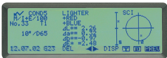
Color differentiation and color space graphics with evaluation

"The Konica Minolta Sensing measuring system is the perfect companion to our quality management system with its easy to use, portable spectrophotometers. They are an important constituent with regard to our quality and our corporate identity", summarizes Linkersdörfer. ■