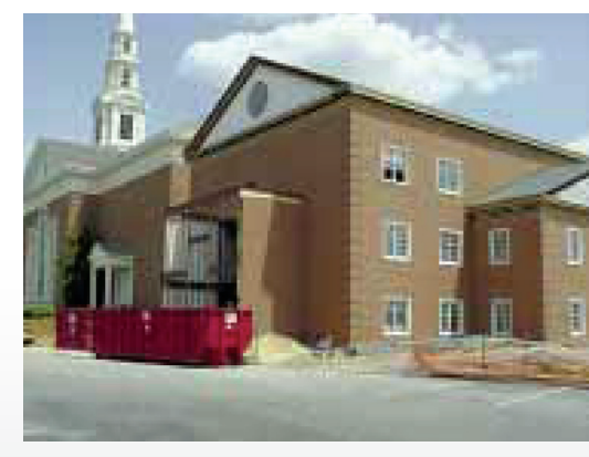
Figure 8: The Completed Addition with Successful Color Match

be evaluated in the same way. Also, the addition of recycled process water or effluent water can be tested for effect on color. Color monitoring in these cases can establish standards which can help solve environmental problems without sacrificing product quality and integrity.