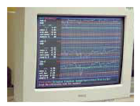
Figure 4: Daily Report on Color