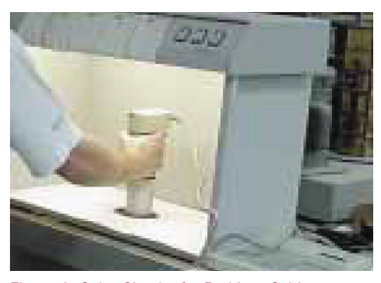
Figure 6: Color Check of a Red Iron Oxide

were established based on color. Decisions could then be made as to whether the additive might be effective without changing the color. Body additions of fluxes, bottom ash, fly ash, etc., can