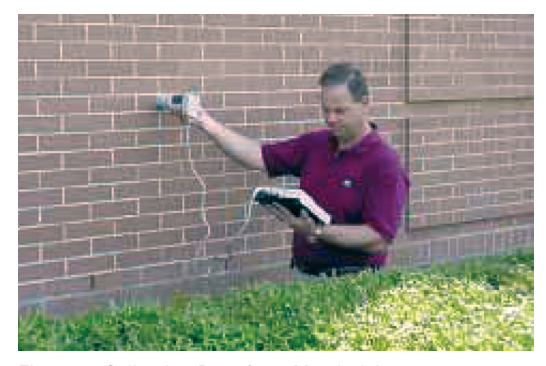
Figure 7: Collecting Data for a Match Job