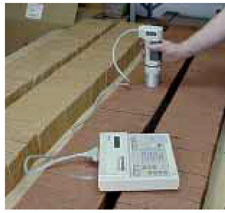
Figure 3: Color Room Layout

used. About 18 months ago, a program was started in which the colorimeter is used to check incoming bulk coloring agents such as manganese dioxide and red iron oxide (Figure 6). Color control charts were established and these are used to accept or