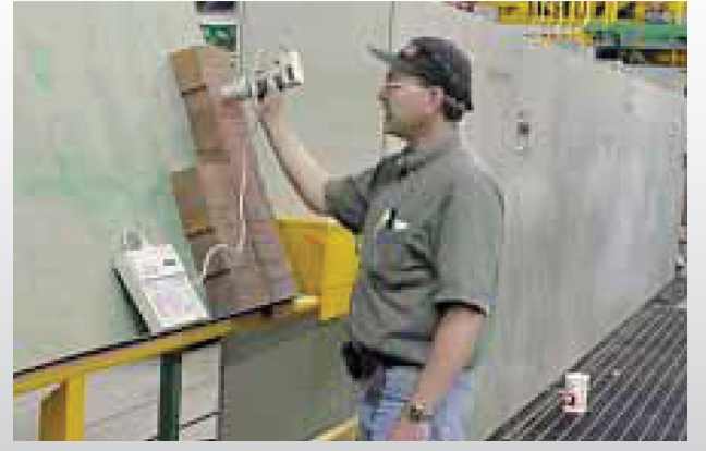
raw materials and granular

Other areas of use for the colorimeter have been in the color evaluation of both incoming body