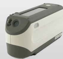
CM-2600D Numerical UV Control