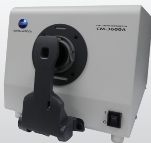
CM-3600A Numerical UV Control