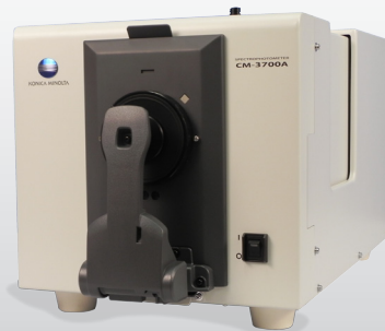
CM-3700A Traditional Filter Method