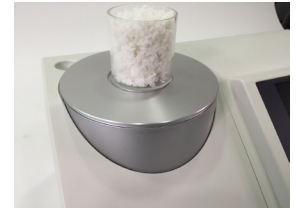
Cell on CM-5

The petri dish or tube cell can be placed on a spectrophotometer like the CM-5 for fast and easy measurements of the desiccated coconut. Alternatively, the Chroma Meter CR-410 may also be used for such measurements with the necessary accessories.