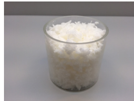
A Ø60 x H60 mm cell