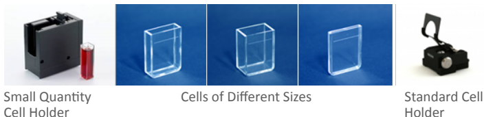
Small Quantity Cell Holder

In the flavour and fragrance industry, it is very common to work on samples of minute quantities. Therefore, the Konica Minolta CM-5 system also offers solution with cell holders and measurement procedures meant for such small quantity sample type.