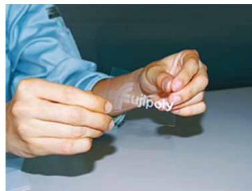
Creation of a 0.2-mm slim LGF