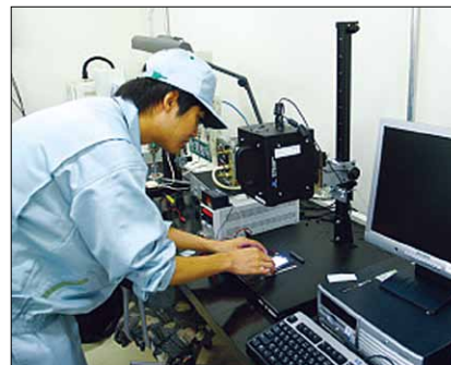
Setting the sample