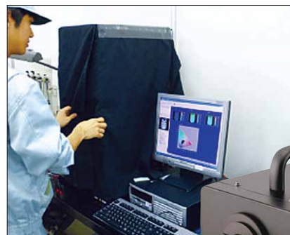
Measuring luminance and chromaticity without ambient light