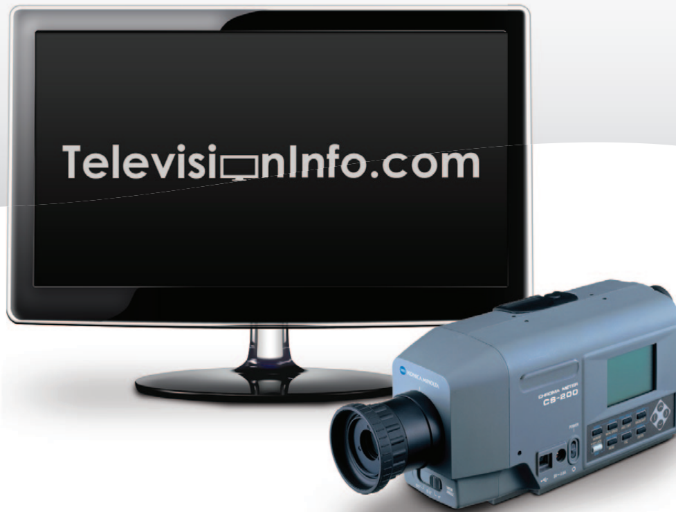
Konica Minolta CS-200